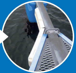
Converted into open corner-fender.