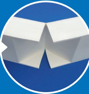
Result after cutting.