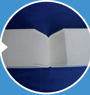
Result after cutting.