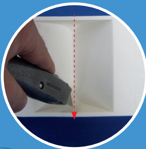
Cut along the centre-marking.