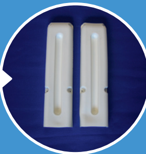
Result after cutting.