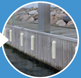
Converted into two vertical fenders.