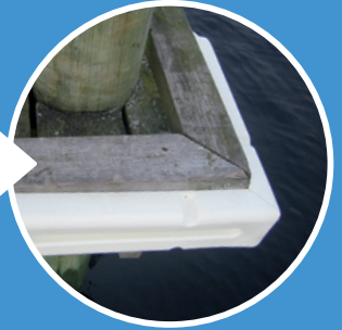
Converted into corner-fender.